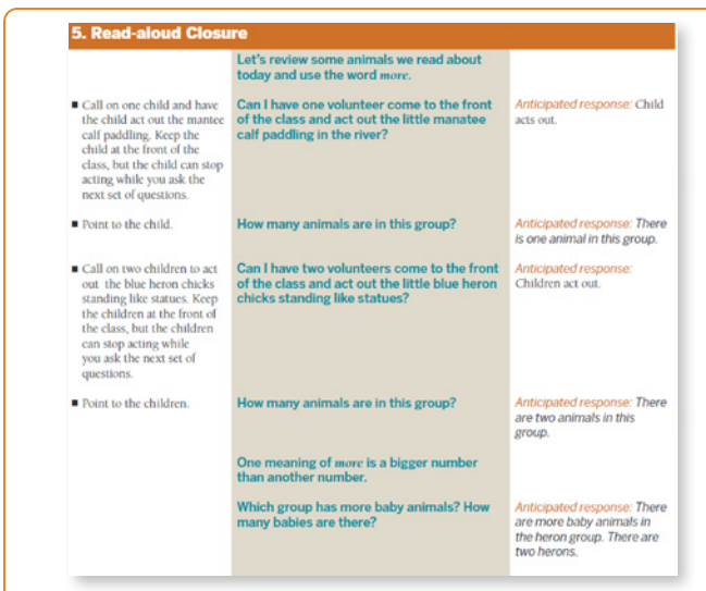
Exhibit 2. Expansions

Expansions involve taking children's language and rephrasing their comments using more specific or complete sentences. In the example here, the teacher language is in the middle column and anticipated child responses are in the right-hand column. For the final question, children may respond with one- or two-word answers. The teacher can use the anticipated response as a model to repeat back to children as a model for the complete statement.