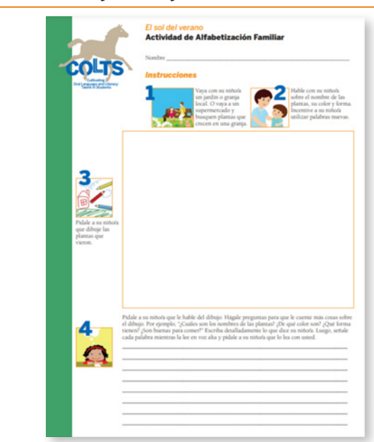
Exhibit 3. Family literacy activities

Family literacy activities encourage families to engage in everyday activities related to the class content and then encourage development of their home language through interactions (speaking, listening, reading, writing) about the topic.