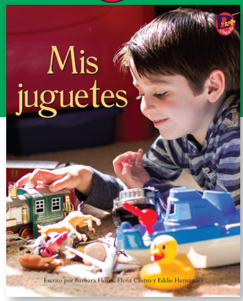
The book introduction and guided reading lesson follow the outline for the English edition. Children need exactly the same support and strategy instruction as their

Be aware that many children speak dialects or may mix Spanish and English. During the introduction, help children understand that "book language" does not always match the words we use every day.