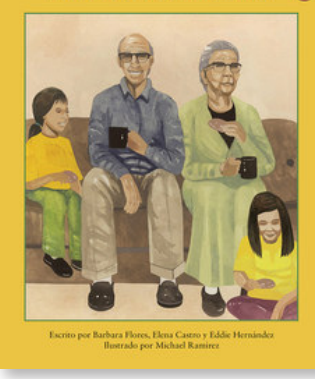
Guided Reading Level: K DRA Level: 20